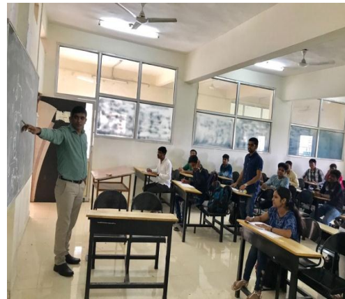
Guest Lecture on Competitive GPAT exam by Competitive GPAT exam